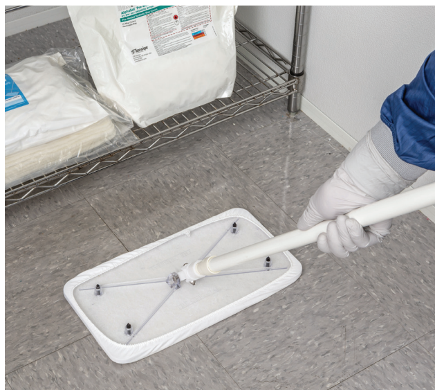
AlphaMop™ 100% Polyester Cover and Pad